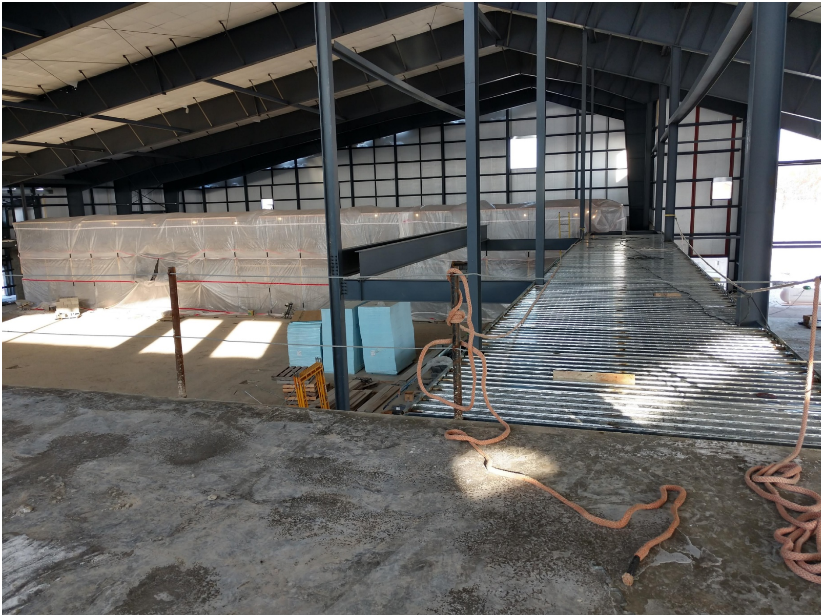
Walking track above stage