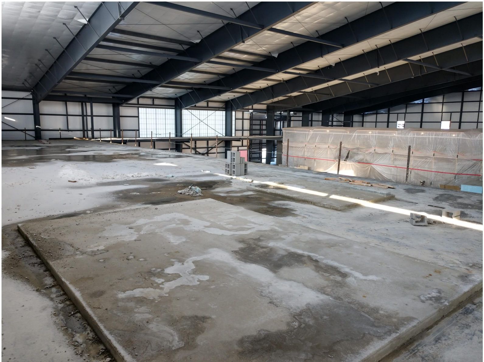
Bleacher mezzanine w/mechanical equipment slab in foreground