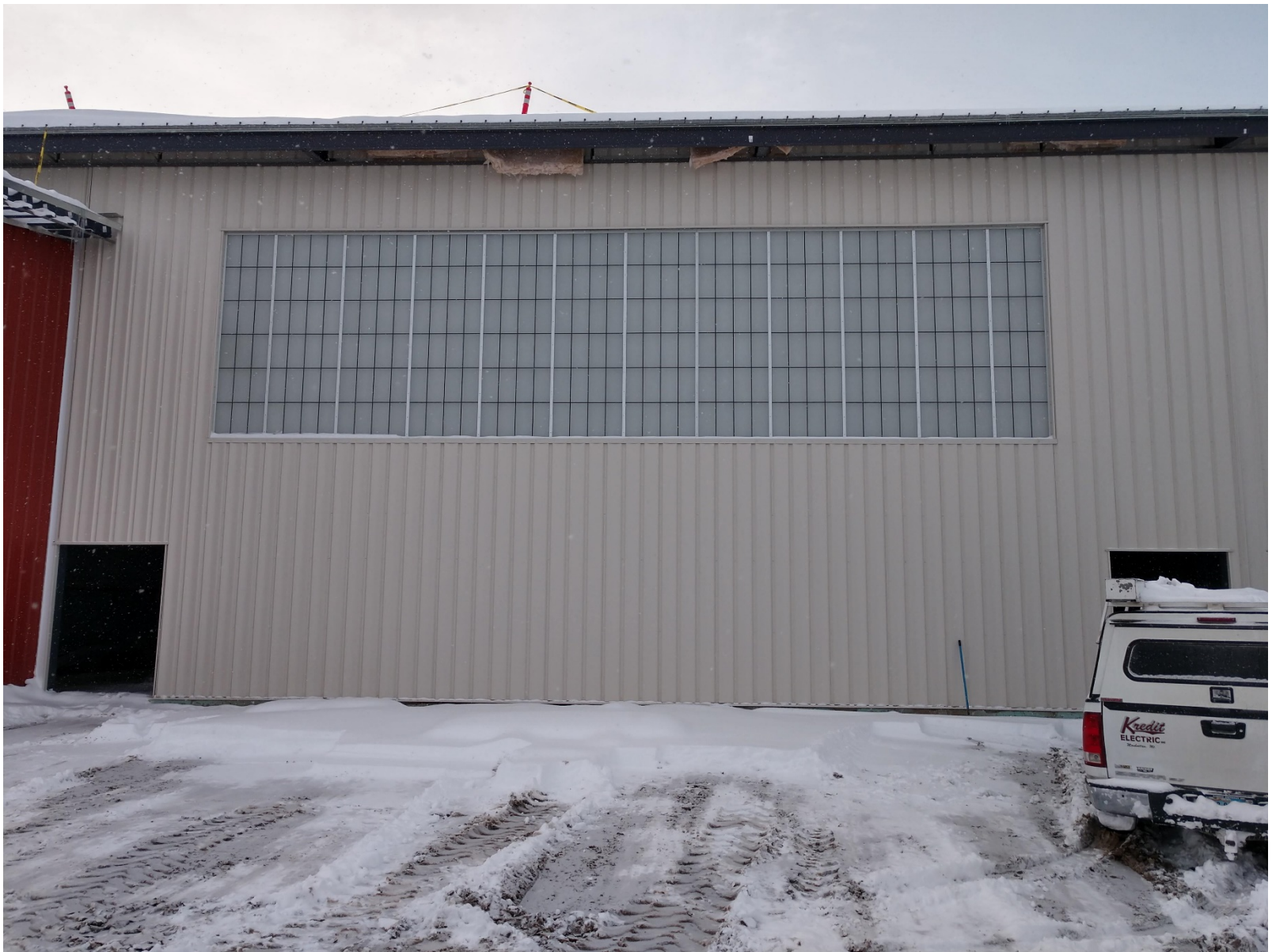
Kalwall at end of gym